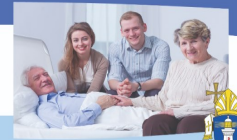
Hospital Chaplaincy and Pastoral Care